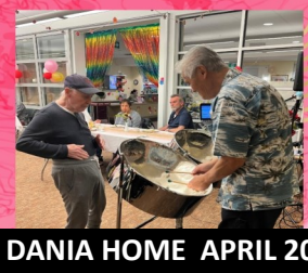
AROUND DANIA HOME APRIL 2024