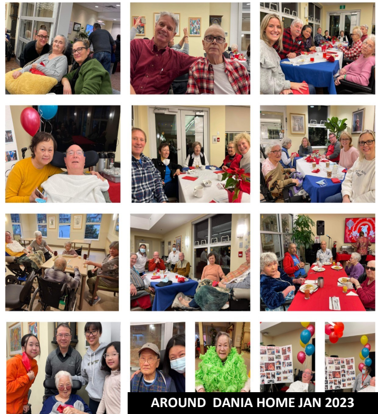
AROUND DANIA HOME JAN 2023