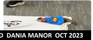
AROUND DANIA MANOR OCT 2023