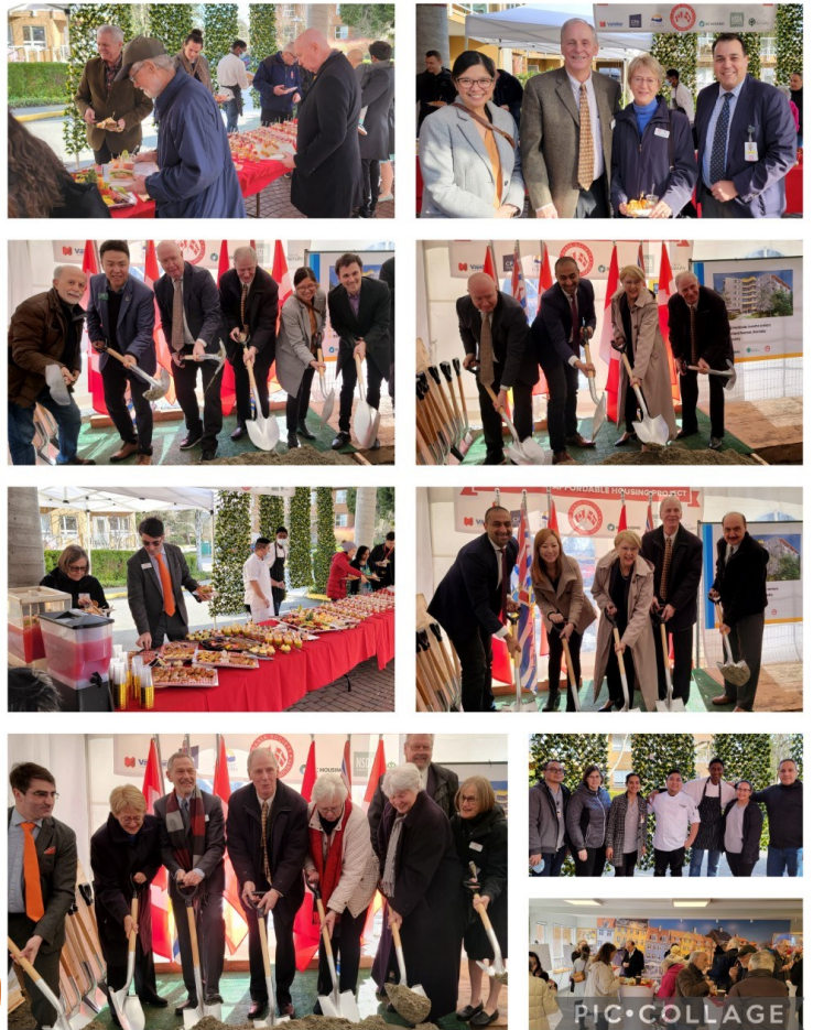
Breaking Ground on Dania Seniors Affordable Housing Project February 10, 2023

Date: March 17, 2023 Time: 11:00 AM Location: Family Room