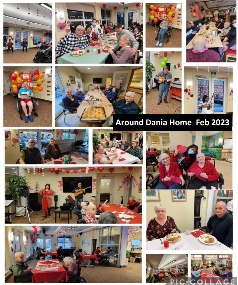
Around Dania Home Feb 2023