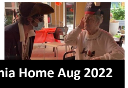
Around Dania Home Aug 2022