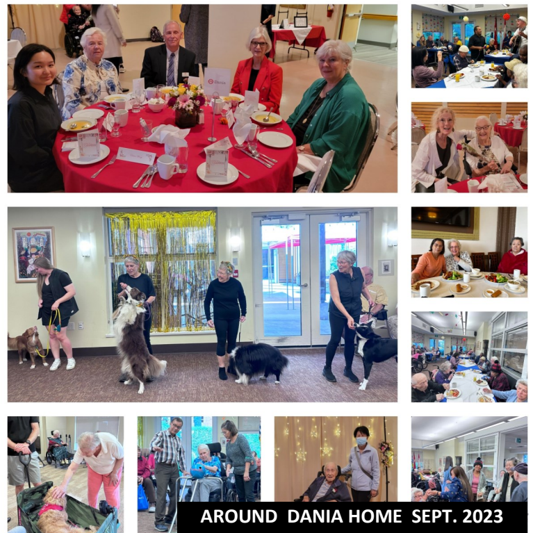
AROUND DANIA HOME SEPT. 2023