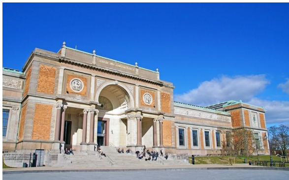
The National Gallery of Denmark (Statens Museum for Kunst), Copenhagen

Covering more than 700 years of European and Scandinavian art, the museum displays paintings by the Dutch Masters, Picasso, and Edvard Munch among others.