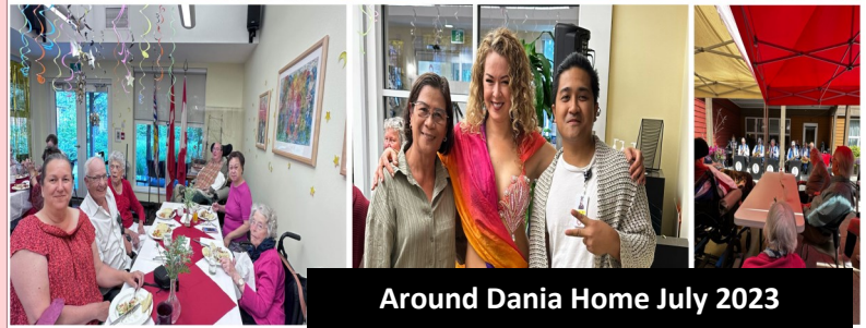
Around Dania Home July 2023