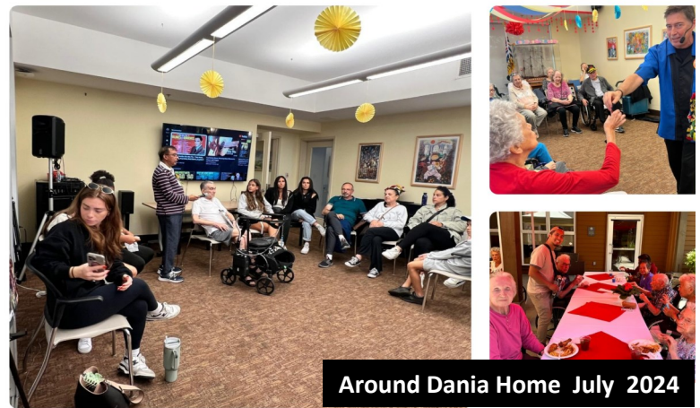
Around Dania Home July 2024