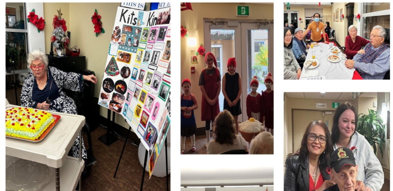
AROUND DANIA HOME NOV 2023