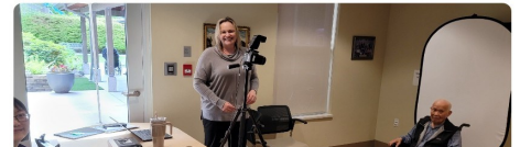
AROUND DANIA MANOR JUNE 2024